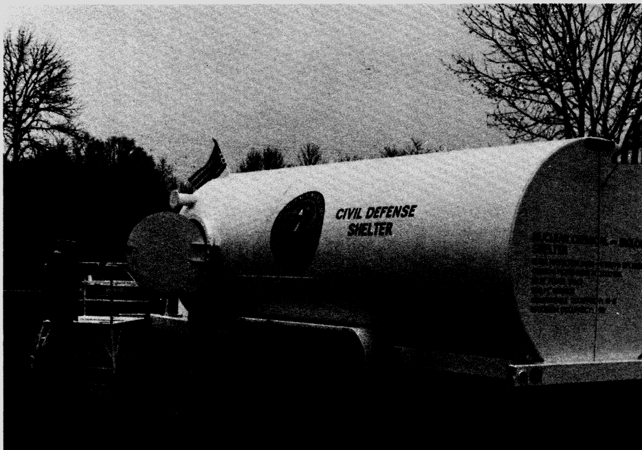
FEMA Mobile Display Shelter at The National Emergency Training Center (With the seal of the Federal Emergency Management Agency)

These displays are the most effective tool for public education about civil defense that has been used anywhere in the United States. Pamphlets are fine; books are better; pictures are "worth a thousand words"; but the real thing which any individual or family can tour at a fair, school, parade, or other public place or event is worth more than all the pamphlets, books, and pictures combined. Approximately 30,000 people took the time to tour one at the Utah State Fair this past summer. Their reaction to the display was very positive. Even the cautious instructors at NETC arrange to get their curious classes into that display, although they are continually opposed by some of their superiors.