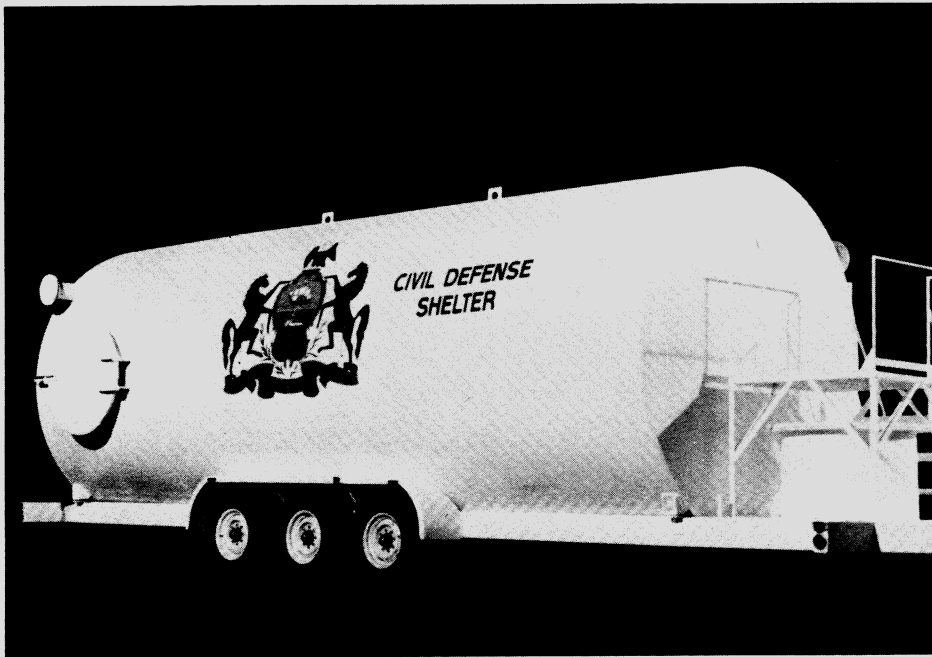
Pennsylvania Mobile Display Shelter (With the coat-of-arms of Pennsylvania)

You can help! Please ask to see and use the three government mobile shelter displays. Ask in writing . Document the replies. You may be given excuses. "The shelter is out of service." "It isn't my responsibility." "We are still working out guidelines." Please send us copies of the replies you receive and keep asking.