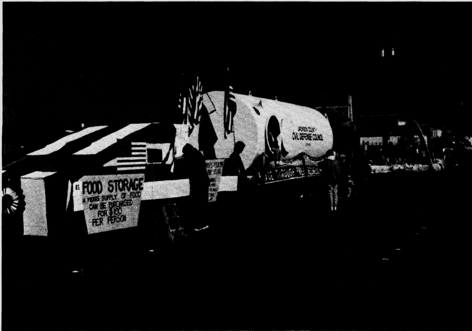
Jackson County Civil Defense Mobile Shelter Display During the Annual Parade in Medford Oregon

The shelter rooms of the Oregon and Maryland models are 8 feet in diameter and 22 feet long, while the Pennsylvania and Utah model rooms are 9 feet in diameter and 24 feet long. The overall displays are 8 and 1/2 feet wide and 30 feet long and 9 and 1/2 feet wide and 32 feet long. They are equipped with blast door displays, LUWA ventilation systems and other habitability items. These shelters would be fully functional if properly installed underground.